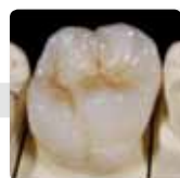
Fully anatomical, stained and glazed