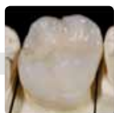
Fully anatomical, glazed