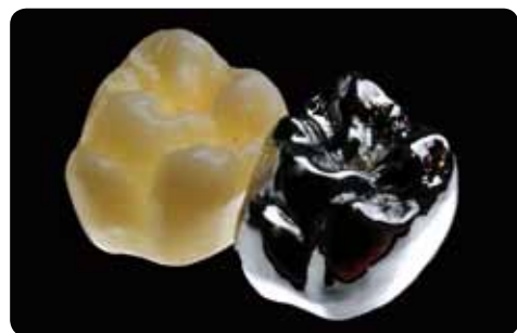
IPS e.max Press crown compared to a full cast crown W. Weisser, Germany