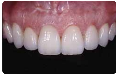
Complete dentures with IPS e.max Press Prof. Dr D. Edelhoff / O. Brix, Germany

Select, in cooperation with your laboratory, the suitable solution for the respective patient case: a cost-effective, fully contoured restoration as an economical and appealing alternative to a full cast crown. Or you can choose the more exclusive version fabricated by means of the cut-back and layering technique, which will meet even the most exacting esthetic requirements of your patients.